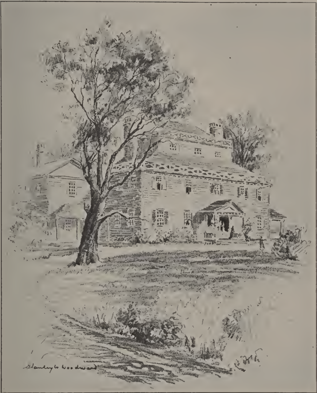
THE QUINCY MANSION